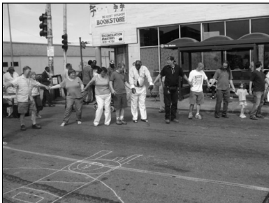
Friendship Dance: 2 nd Annual Troost Festival 2006

On April 19, 2008 the 4 th Annual "Troost Avenue Festival" is held. Dedicated to "Porter Slave Plantation Remembrance Day", the Troost community seeks to honor the slaves that worked the Porter Plantation. Indeed, due to their labors the Porter land rose in value to become "Millionaires' Row".