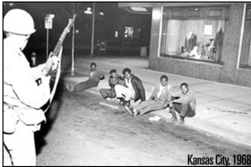
Students Arrested during riots in April, 1968

People still talk about the shopping they did at J.C. Penney's, Jones, Woolworth's and Katz Drugs in the 1960s.