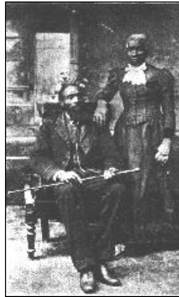
Missouri Slaves: 1858

Union Cemetery along with the Porter family.